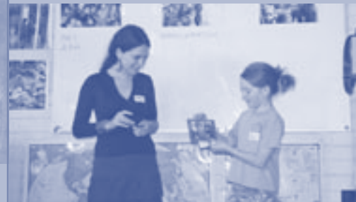
Talking pictures – Fremantle Primary

A cross-cultural exchange between students at White Gum Valley Primary School and street children living in Dhaka, Bangladesh, is still underway more than a year after the VISIBLE project visited the school.