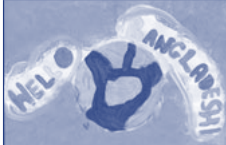
Samples of artwork on -route to Bangladesh from the art students at White Gum Valley Primary school.