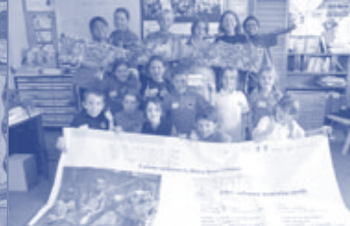
Amar desh Australia! – Beaconsfield Primary