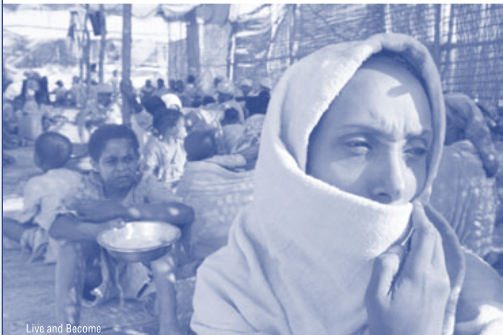
Live and Become

Applications for kultour 2008 can be downloaded from the kultour website and should be submitted to the kultour Chief Executive Officer by email no later than 5pm Thursday 1 February, 2007.