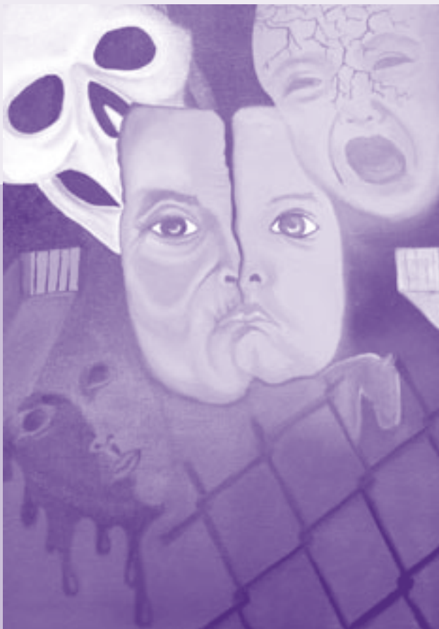
Children in Detention , oil on canvas.