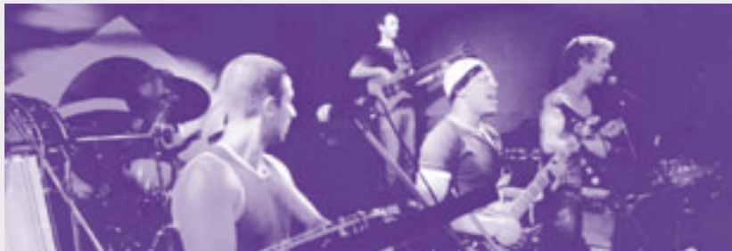
Sambalicious will perform at the annual KULCHA on Swan Series.

Pack a picnic and head to the City of Swan for another series of free outdoor multicultural concerts! First held in 2002, the KULCHA on Swan annual program is a vibrant showcase of some of Perth's best world music artists. This year's program includes Latin jazz/funk band Sabroson, Brazilian party band Sambalicious, Gypsy folk from the Kashtany Duo, Ghanaian drum and dance group WALA direct from West Africa. Presented by KULCHA and the City of Swan, the series will commence on Saturday 4 November and continue until Saturday 31 March, 2007. For a full program of events please visit the KULCHA website – www.kulcha.com.au