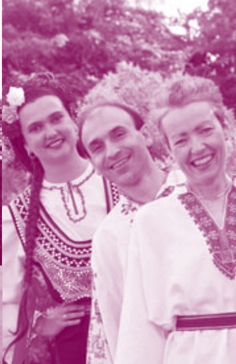
JUNE - ZHIVA VODA