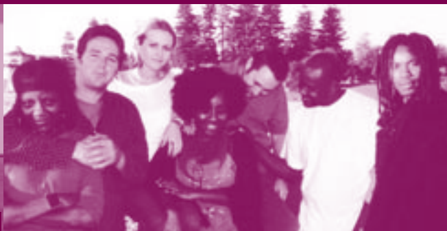
DECEMBER - RAGGABEATS