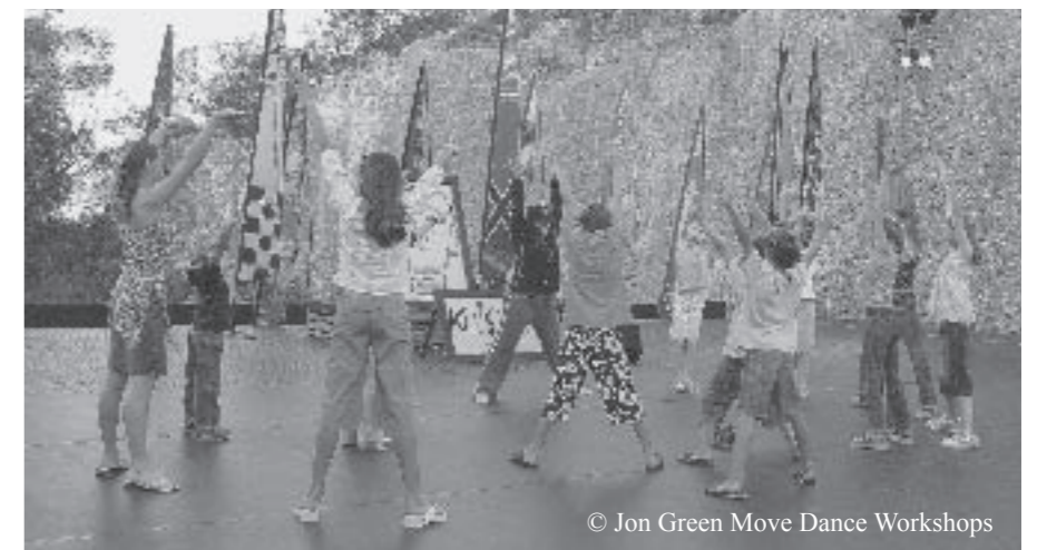
© Jon Green Move Dance Workshops